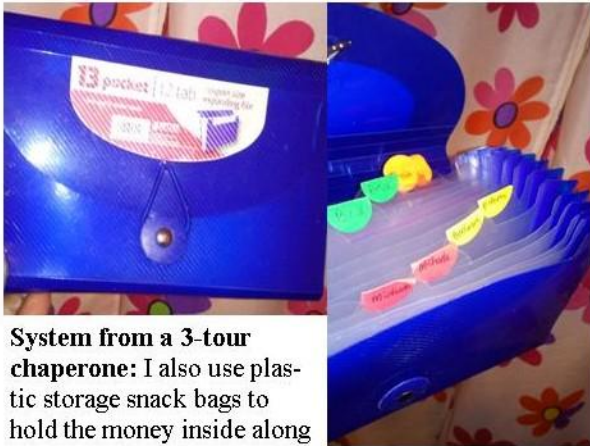
System from a 3-tour chaperone: I also use plastic storage snack bags to hold the money inside along

with passports. I also color code each student's passport, storage bag, and section inside folder with garage sales tags for easy transactions during airport times and shopping. You can easily add a small pen and pad for quick notes.