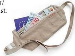
Sample money belt/ fanny pack for waist.

with passports. I also color code each student's passport, storage bag, and section inside folder with garage sales tags for easy transactions during airport times and shopping. You can easily add a small pen and pad for quick notes.