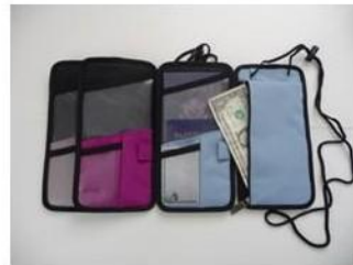
Sample neck pouch with multiple pockets.